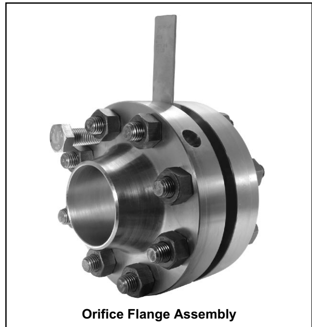
Orifice Flange Assembly

As standard, two ½" NPT tapings are provided in each flange, one with a plug. Other thread sizes are available on request. Socket weld connections may be specified, and butt weld pipe nipples are also available. Tapings are generally 'flange' type, but corner tapings are optional.