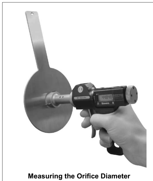
Measuring the Orifice Diameter