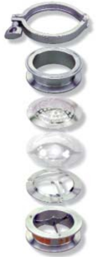
VAPRO in VRDS holder